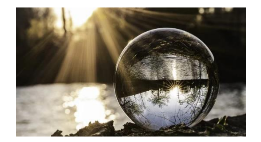
Task 2: Look at 2 photographers that you like the work of. You can research different photographers on Google, Pinterest, Instagram etc. Create a PowerPoint with a page for each of these. The page will contain images of their work and some information about them.