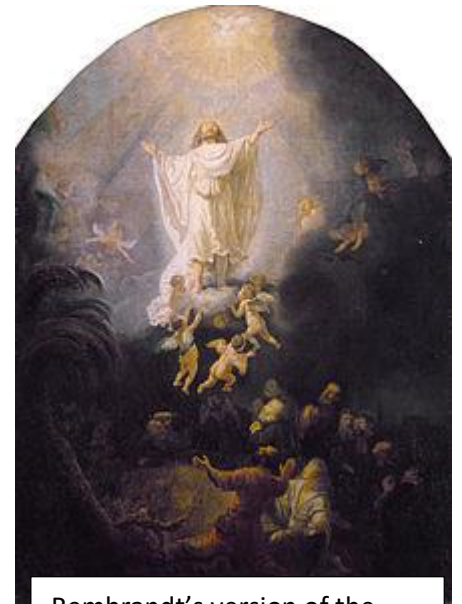
Rembrandt’s version of the ascension

Just as the resurrection is a matter of faith and interpretation, so is the ascension. There are other explanations but if Jesus had the special power of God to rise from the dead, it is equally possible that this same power means he was able to leave the earth physically and return to heaven. Only Mark’s and Luke’s gospels finish off their story by telling their readers that, after meeting his disciples and asking them to carry on his good work, Jesus left them for the last time.