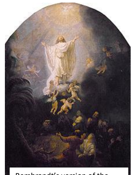
Rembrandt's version of the ascension

What does the fact that this event is called the ascension tell you about where Jesus went? Explain why.